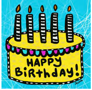
We hope you have a wonderful day!